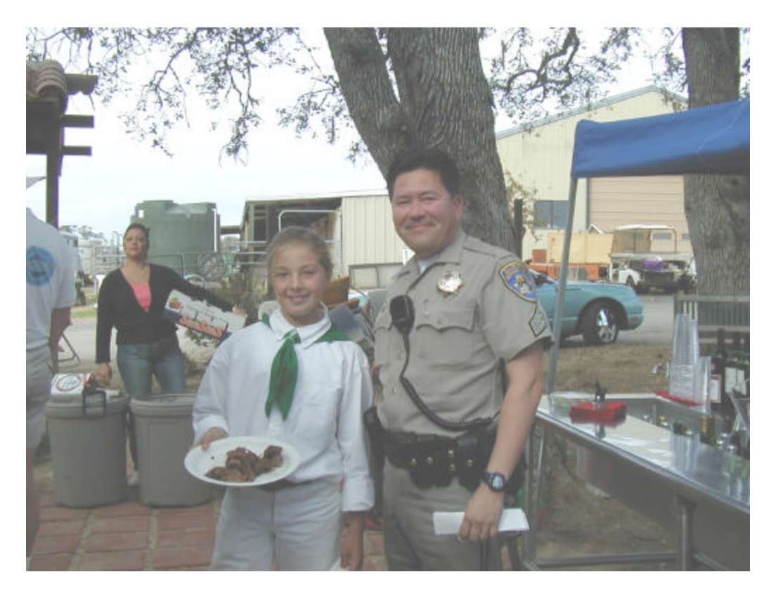
A couple of SLO County's Finest in Uniform